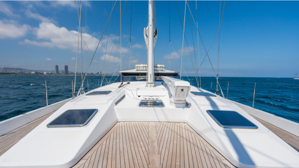
CLICK TO SEE THE PRESENTATION VIDEO