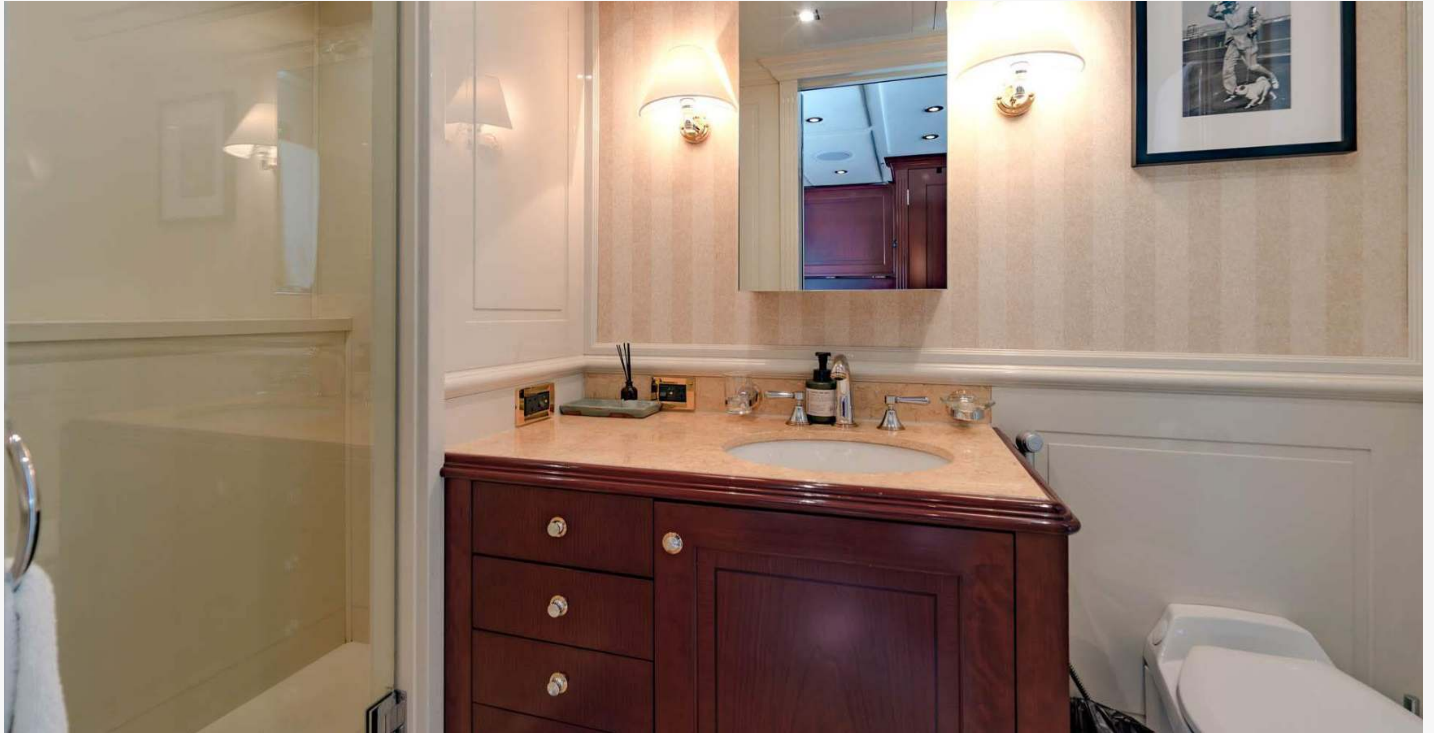
Main Deck Guest Bath