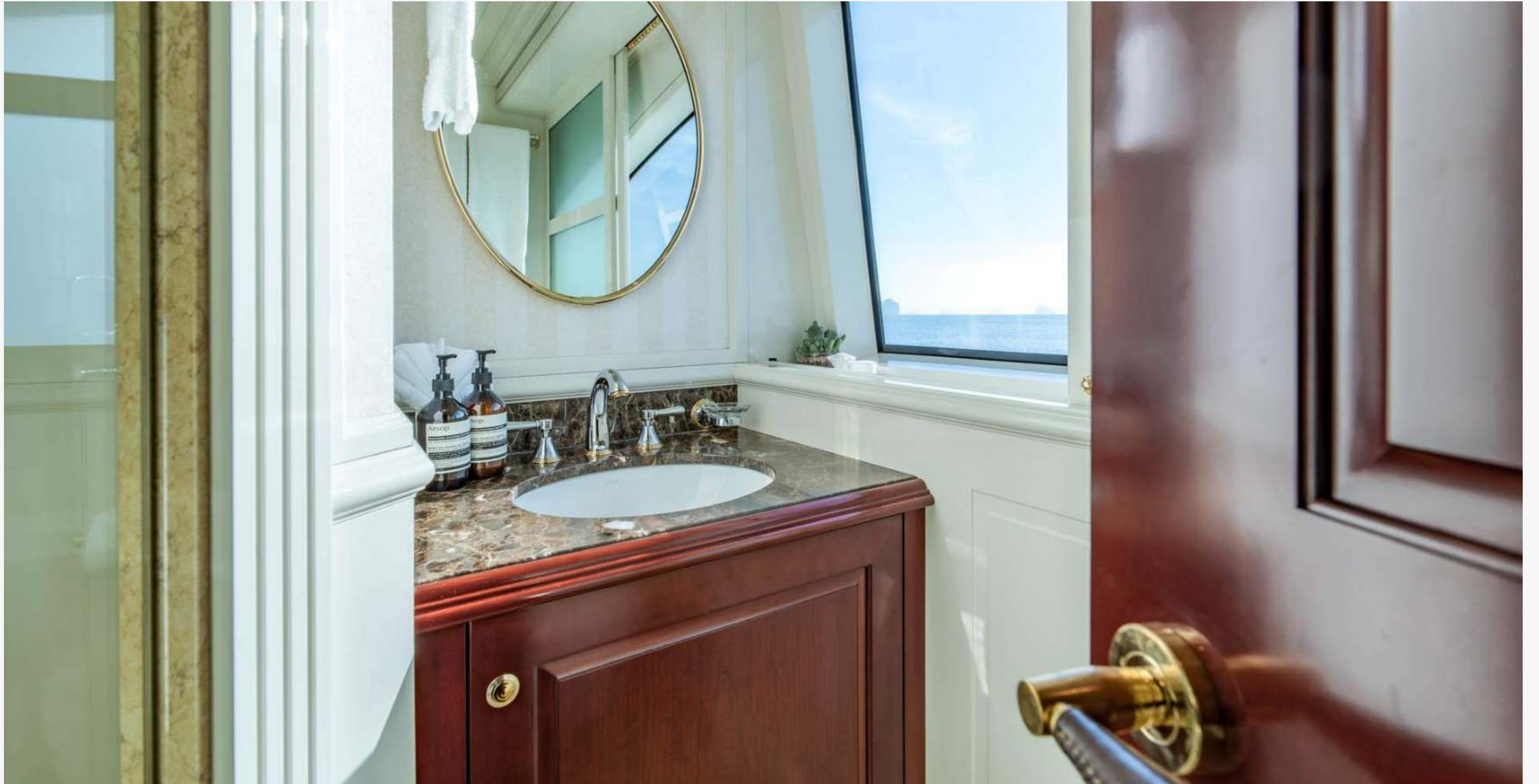
Bridge Deck Guest Bath