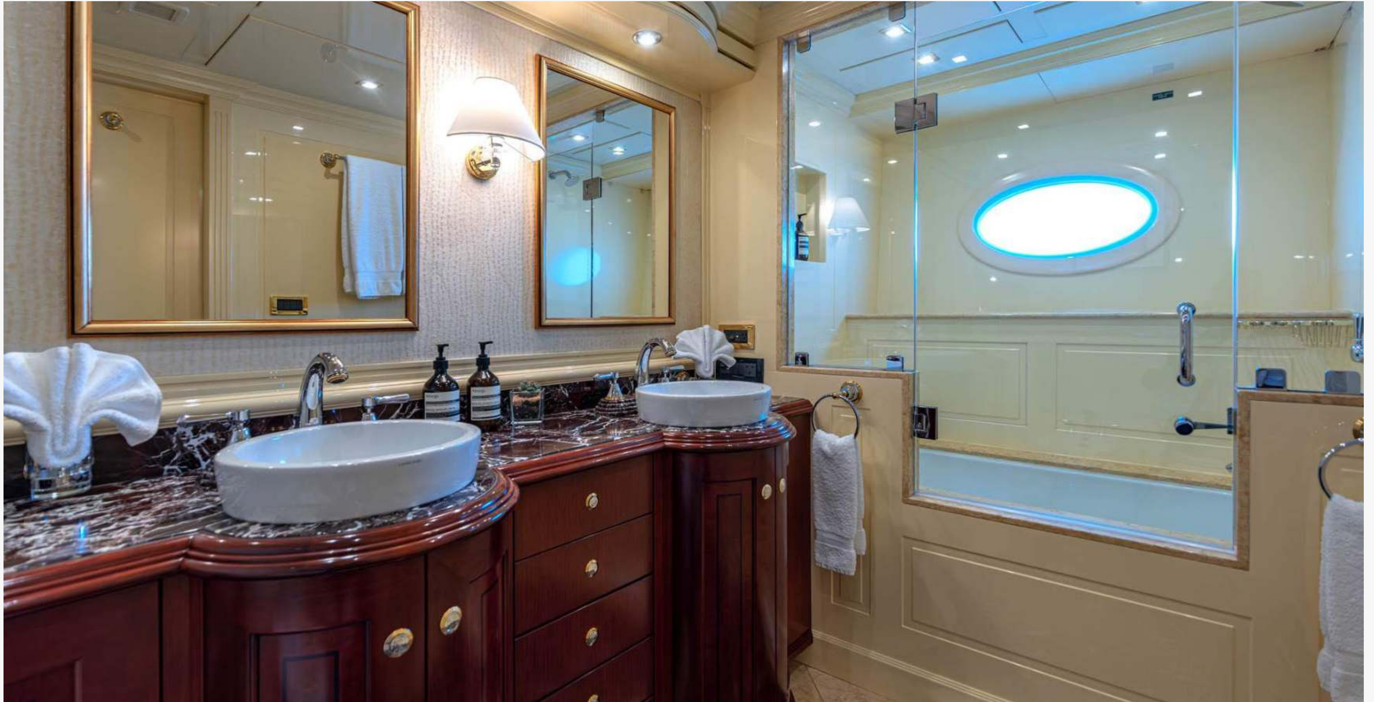
Guest 4 Bath