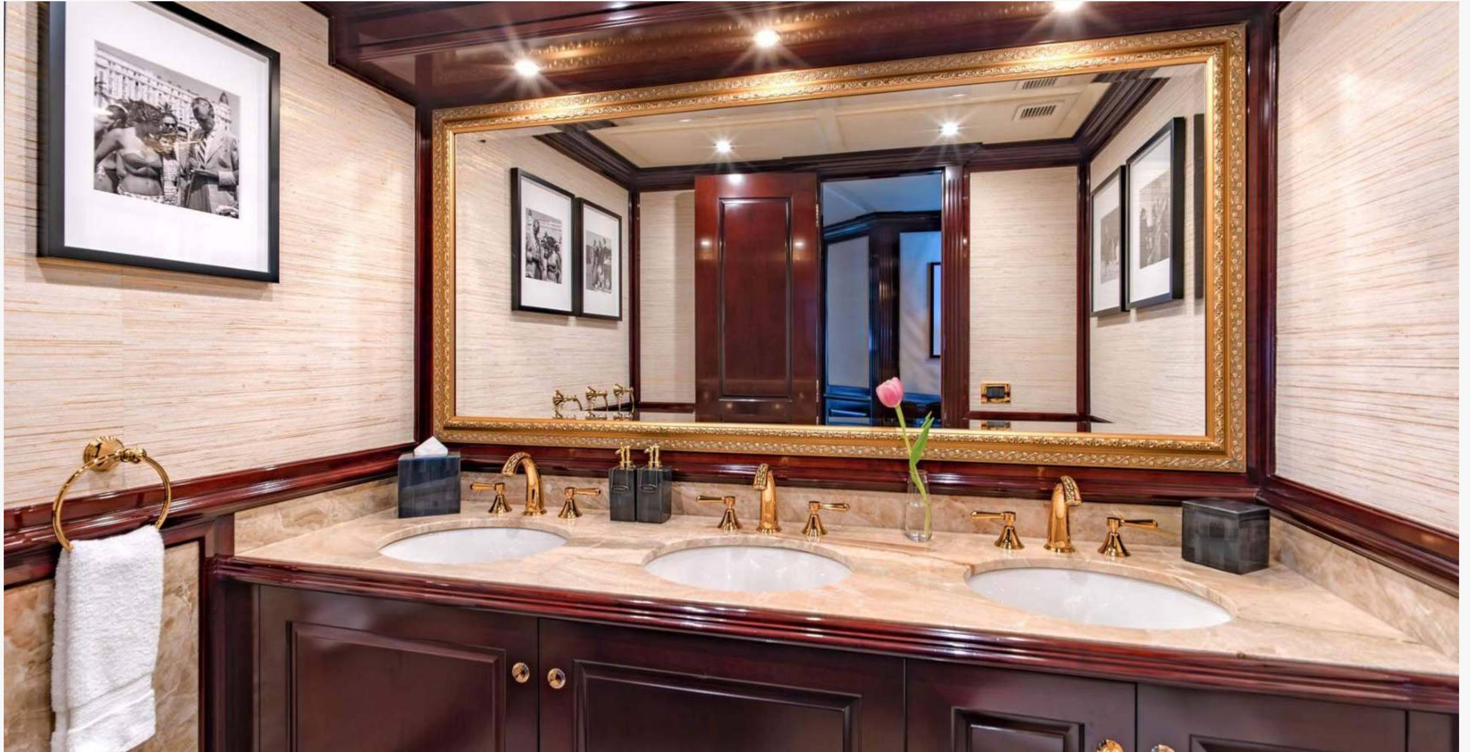
Main Deck Day Head