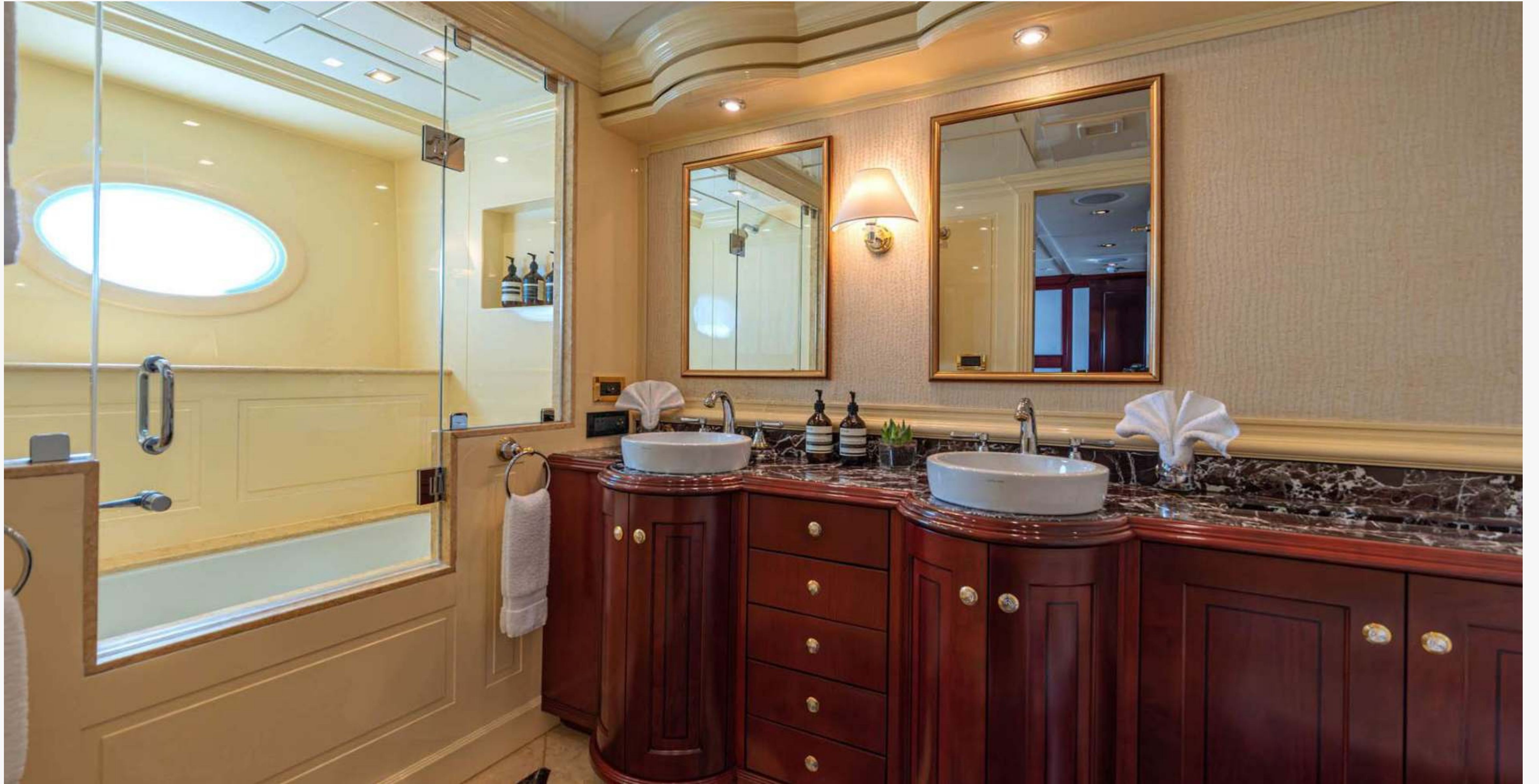
Guest 3 Bath