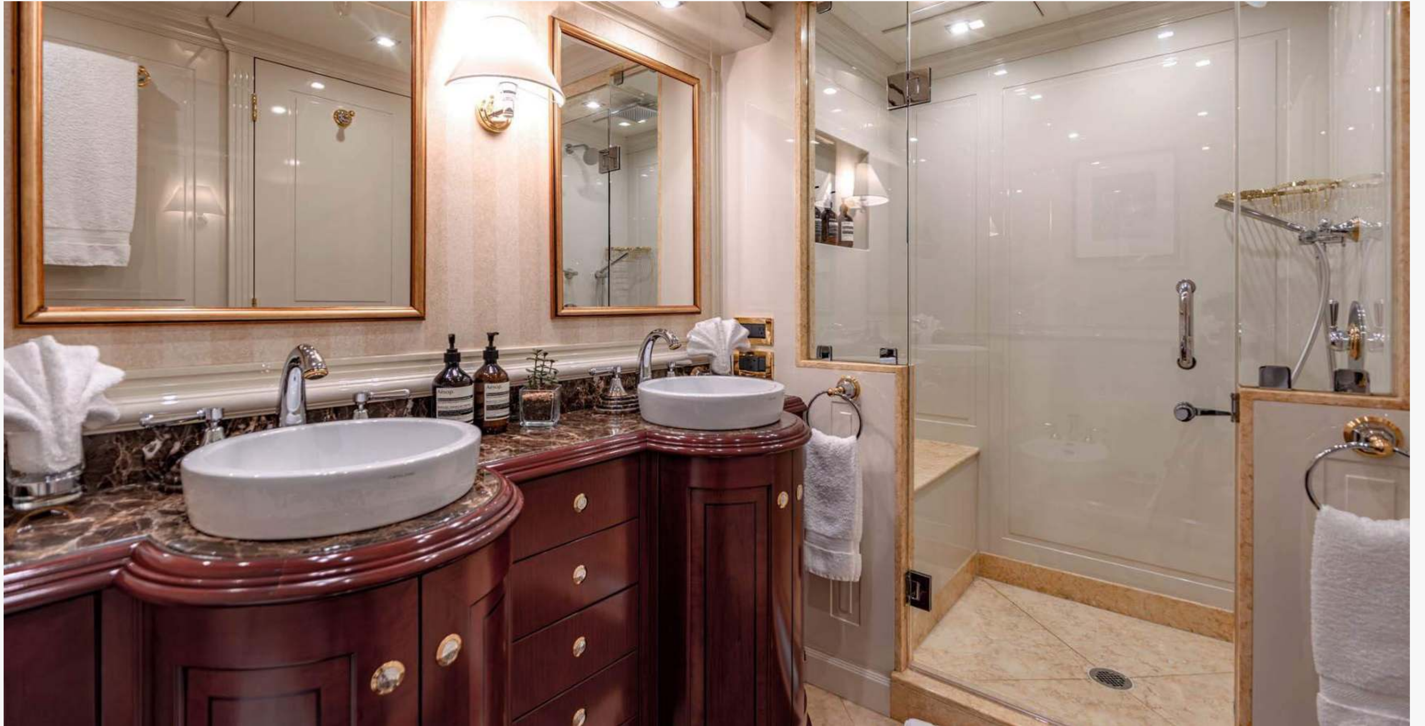
Guest 1 Bath