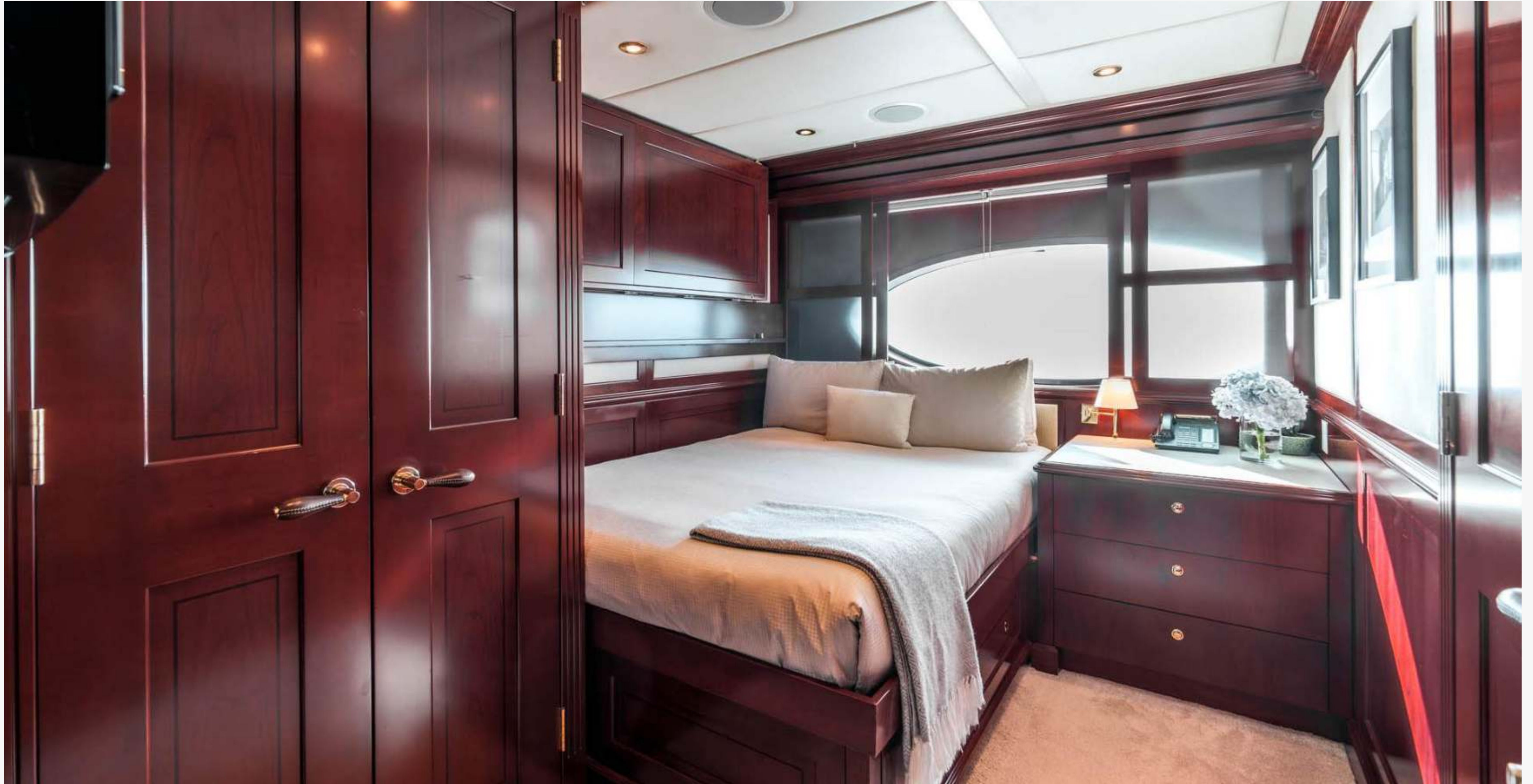
Main Deck Guest