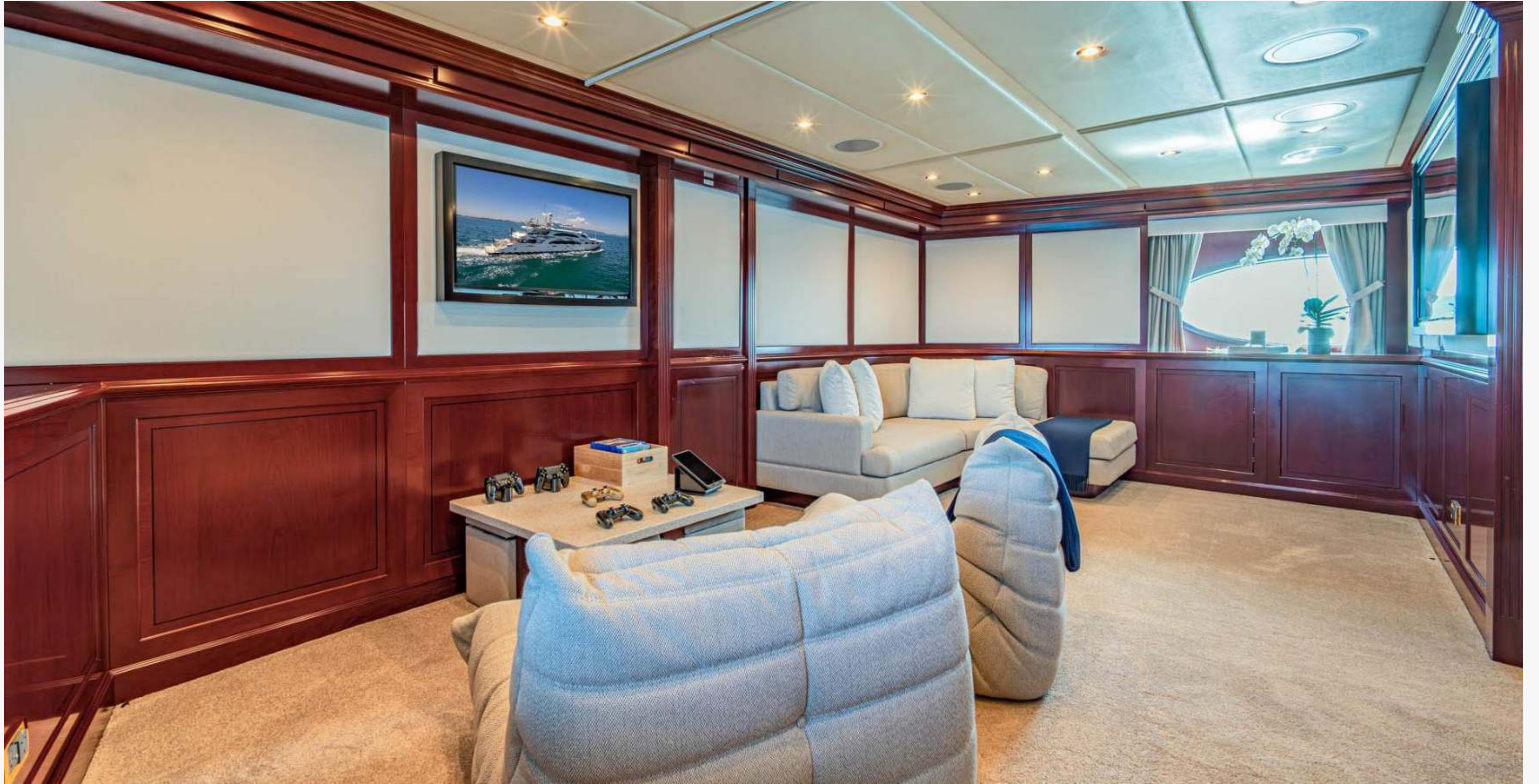
Main Deck Rec Room