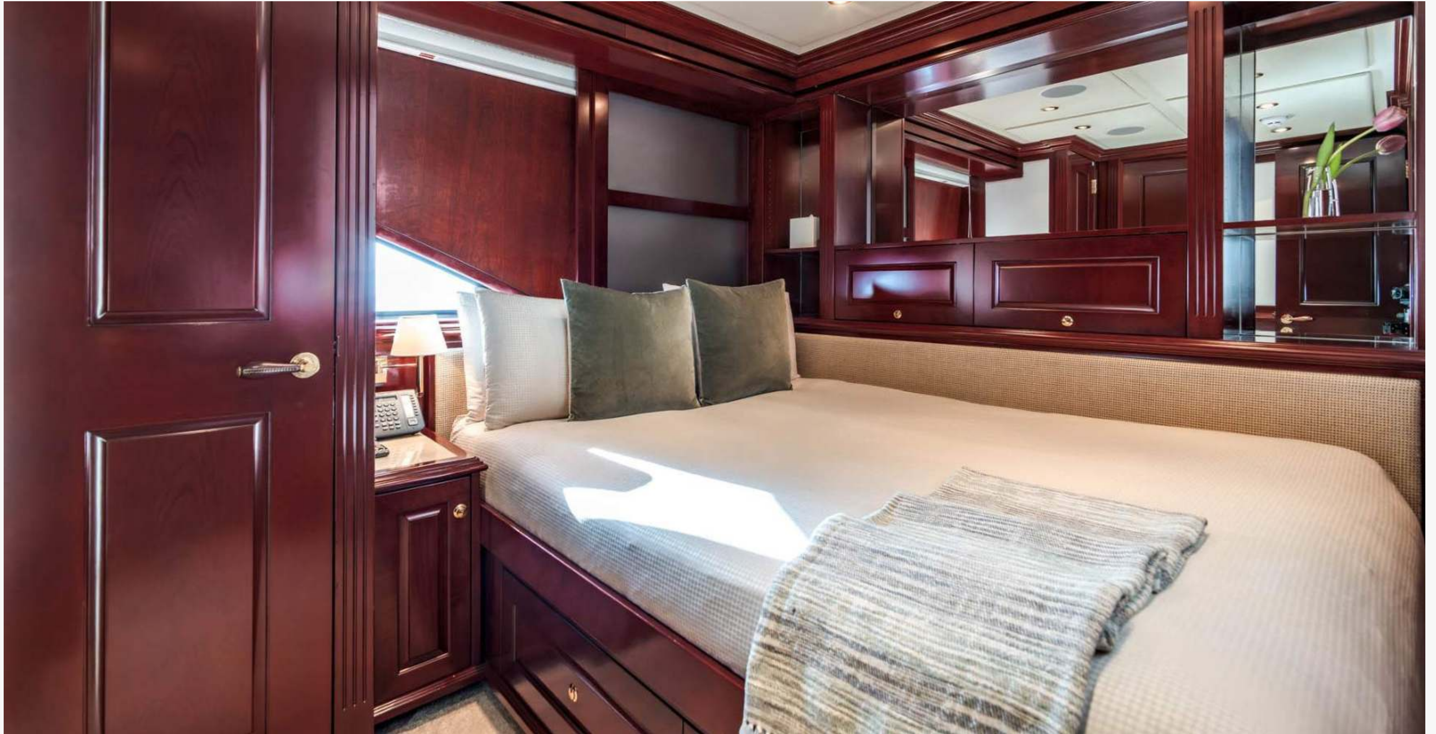
Bridge Deck Guest