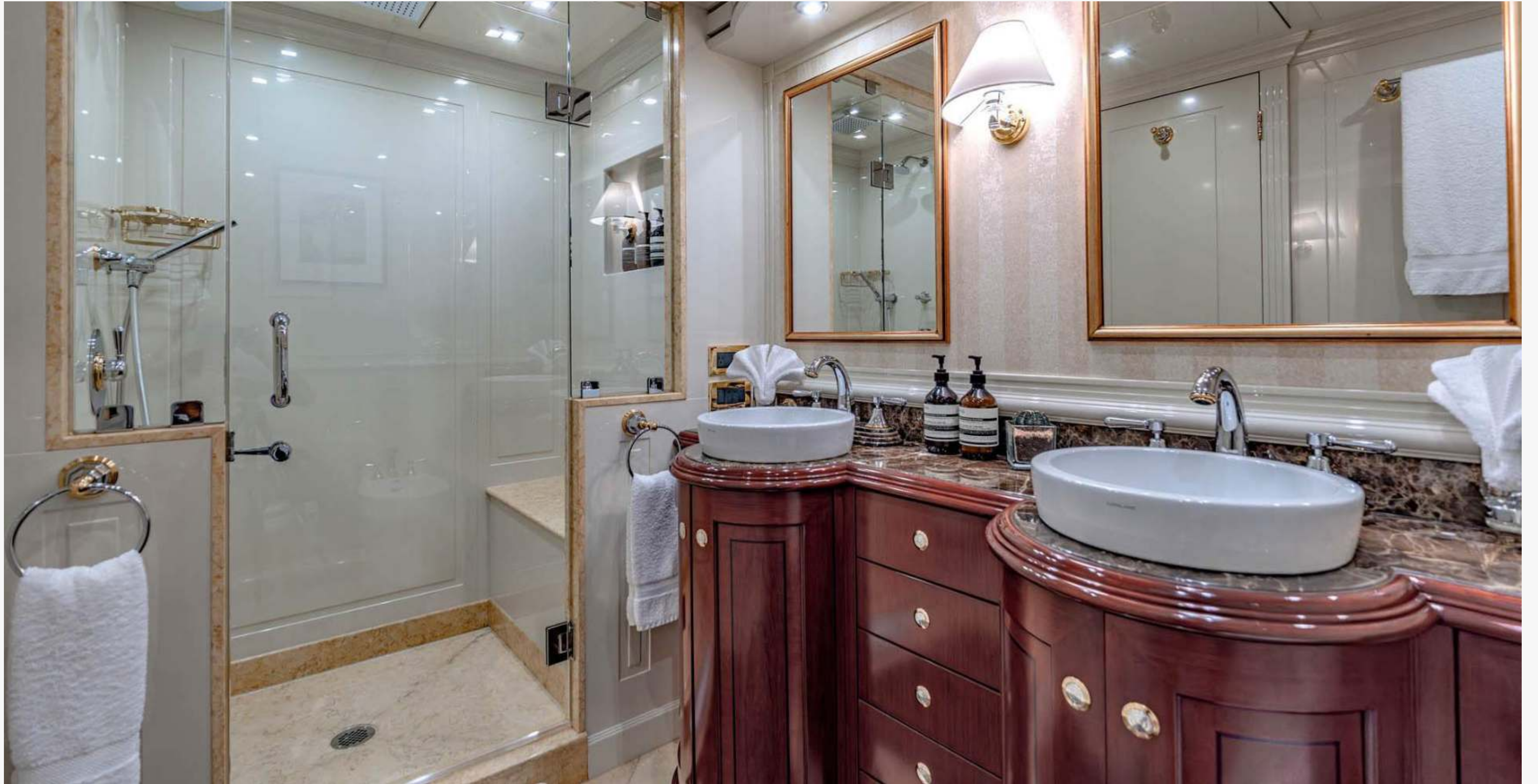
Guest 2 Bath