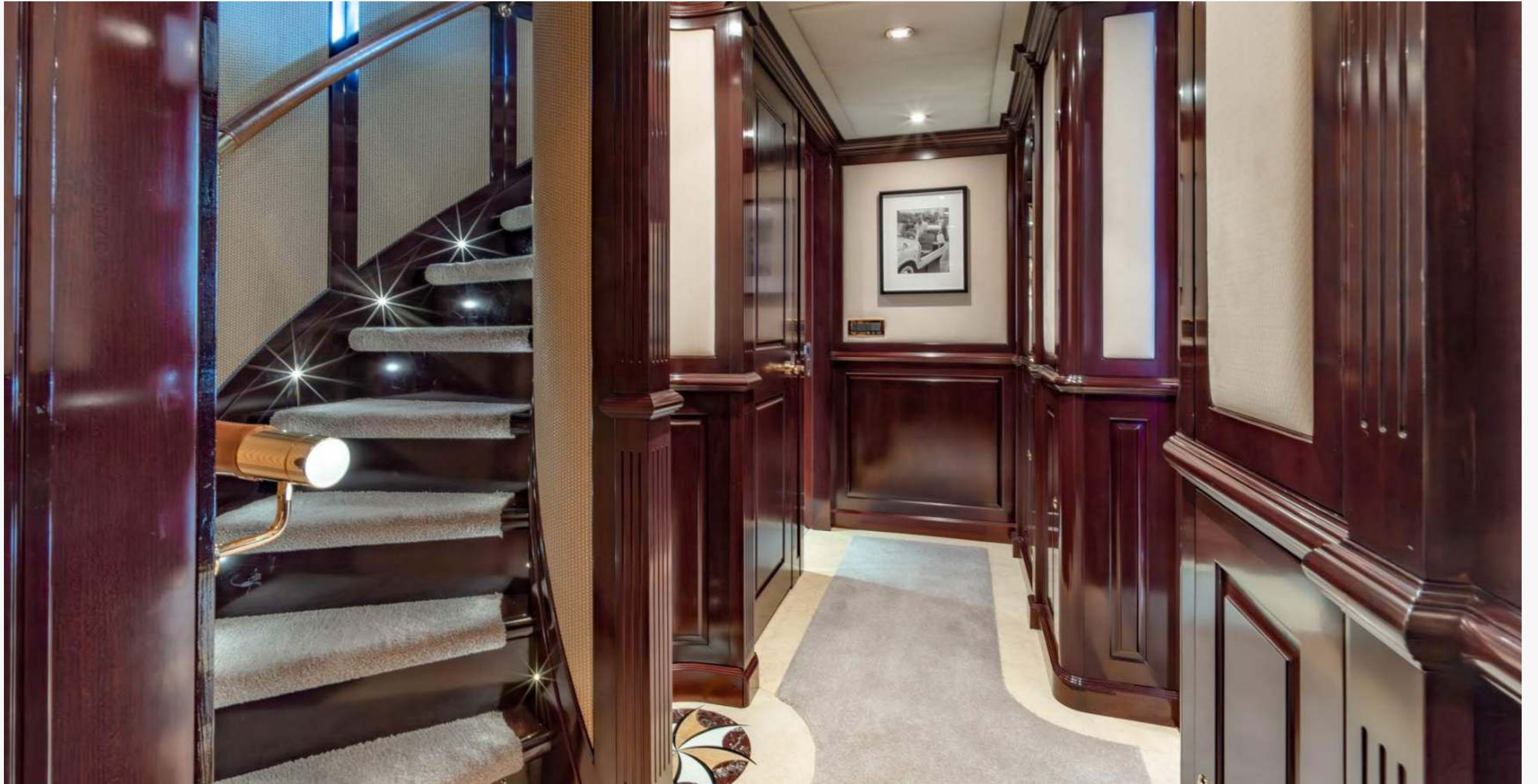
Lower Deck Foyer